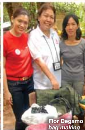
Flor Degamo bag making